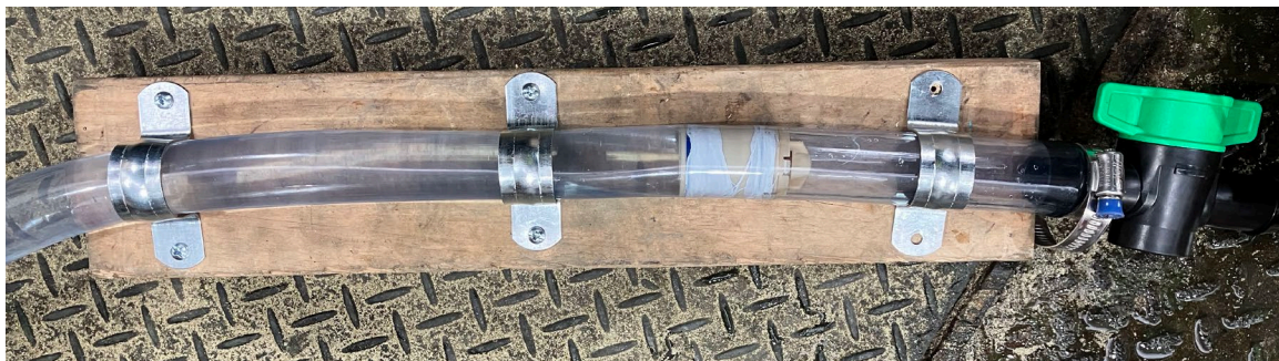
Figure 3 DCV in Clear Pipe with Tap to Control Flow

In addition to laboratory testing and accelerated ageing, a standalone experiment will be conducted to observe flow through individual DCVs. This may provide additional insight into their mechanical operation and potential wear mechanisms. As the DCVs are enclosed within opaque brass meter bodies, fitting a single DCV fitted into a clear, flexible tube will allow flow behaviour to be easily observed (Figure 3). Once fitted into the pipe, this sample may be simply connected to a hose. A more formal setup, fitting the DCV into a clear acrylic tube, may be employed if further investigation is required. A partial depression of the DCV piston spring because of high spring stiffness or misalignment would partially obstruct flow and induce increased fluid velocities, further promoting mechanical wear and possibly inducing cavitation.