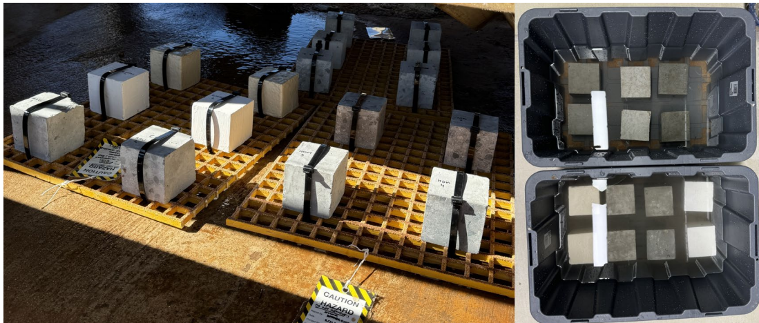
Figure 1 Site exposure samples secured on a grid mesh jig (left); lab accelerated samples submerged in brine (right).